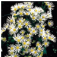
Town Flower : Chrysanthemum