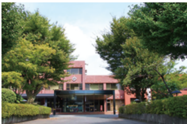
Kikuyo Town Hall Main Entrance

Municipality Government Office Guide Map HP