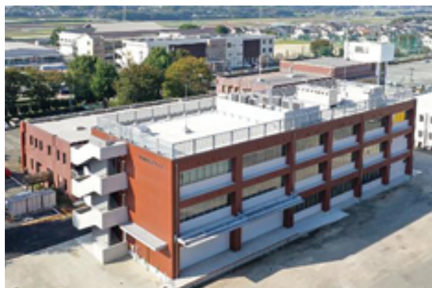
Disaster Prevention Center